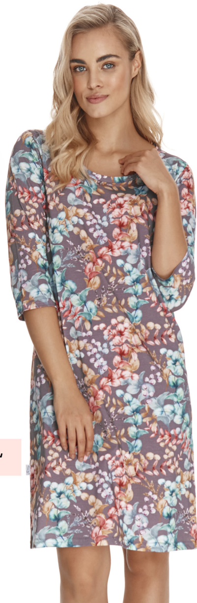
VITA 2797 S-XL 1. 100% COTTON