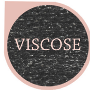
VICTORIA 2774 S-XL 1. 90% VISCOSE, 6% COTTON, ELASTANE 4%