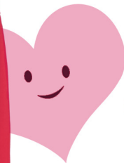
LIVIA 2795 146-158 1. 100% COTTON