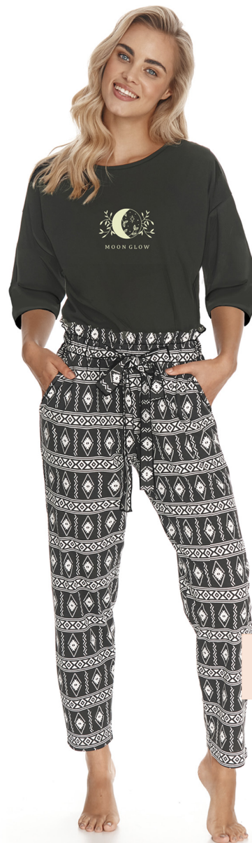
CHANEL 2768 S-XL 1. 100% COTTON