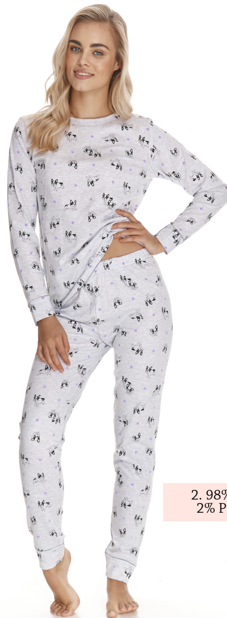
2. 98% COTTON, 2% POLYESTER