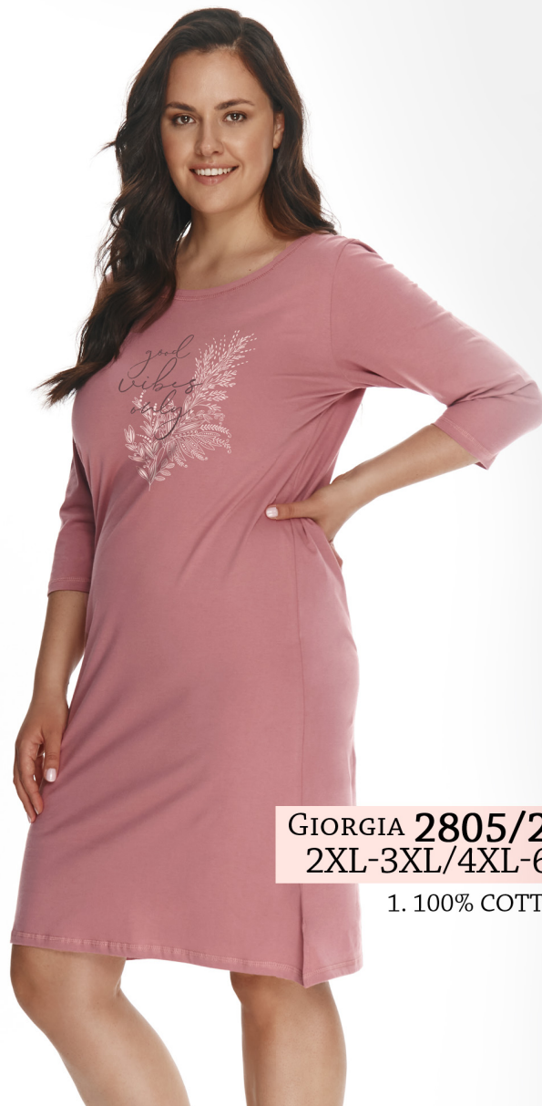
GIORGIA 2805/2806 2XL-3XL/4XL-6XL 1. 100% COTTON