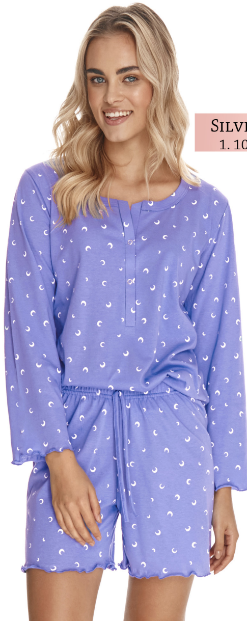
SILVIA 2779 S-XL 1. 100% COTTON