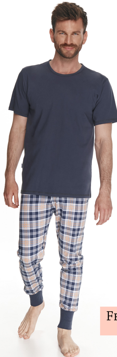
FEDOR 2731 M-2XL 1. 100% COTTON